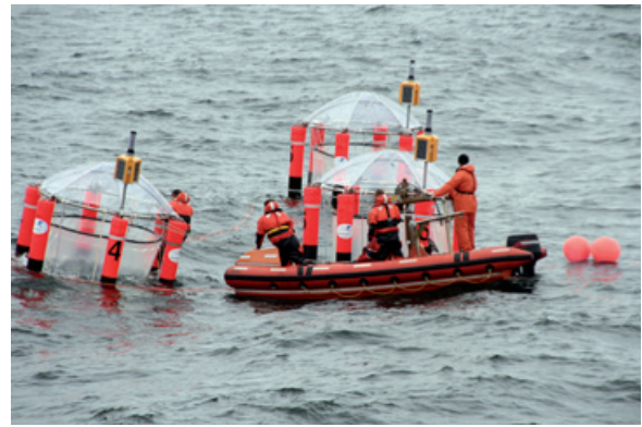
Study of ocean acidification in offshore mesocosm CO 2 perturbation experiments.

The effect of ocean acidification on the global economy will depend on adaptations of the marine ecosystem as well as on human adaptation policies. Both are difficult to anticipate, making it difficult to calculate economic impact. A collaboration of natural and social sciences is required to research the potential for adaptation in both ecosystems and human systems, and the interplay between the two. The costs of adapting to ocean acidification need to be assessed.