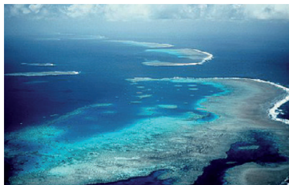
Aerial view of the Great Barrier Reef, one of the world's best protected and most fragile marine ecosystems.

Changes in the global biogeochemical cycles operate on different time scales. Uptake of CO 2 and transport to the ocean interior is a rather rapid process (of the order of weeks to centuries). The effect of increased sedimentary carbonate dissolution (compensating ocean acidification) operates on intermediate timescales of the order of thousands of years. Ultimate recovery of the oceans from