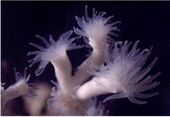
Lophelia pertusa – a cold-water reef-forming coral that lives in deeper water – is widespread across all oceans and, with other calcareous organisms, is threatened by ocean acidification.